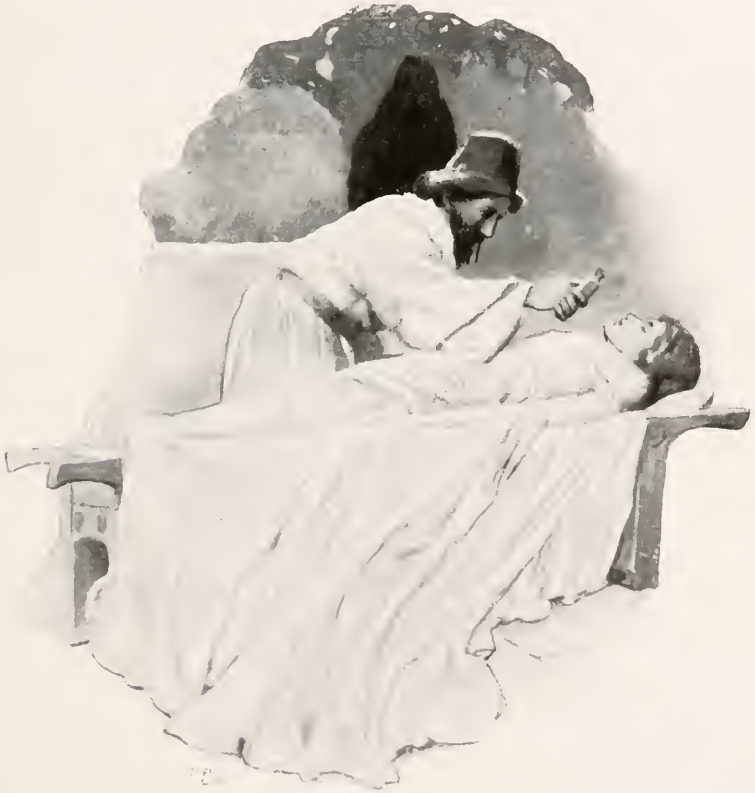
He poured the medicine down her throat (p. 48.)

remember where she was and what had happened; but when she did she flung herself at Mustapha's feet and thanked him for having rescued her from her horrible